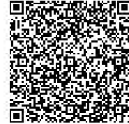
Janardhan S Global Head - Talent Development

Click here or use a QR code scanner from your mobile to validate the joining letter